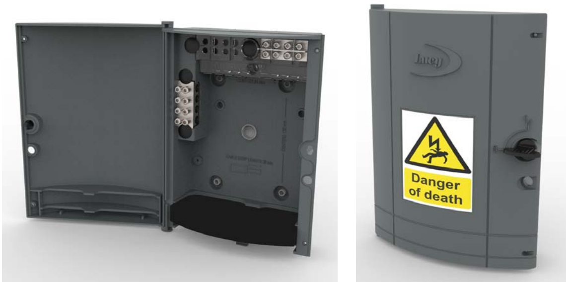
SNE variant illustrated

Pole or wall mounted distribution boxes for aerial bundled conductors. Used in end of line applications where only a single phase and neutral are distributed.