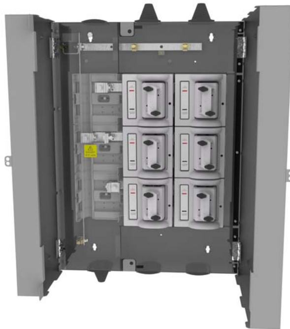
3 way Sub Mains Distribution Board

Indoor surface mounting sub mains distribution boards which accept a single incoming 3 phase supply up to 630A having 2, 3, 4, 5 or 6 triple pole outgoing BS 88 J type fuse ways with 92mm centres. Configured for direct (single cable) connection of incomer to main busbar.