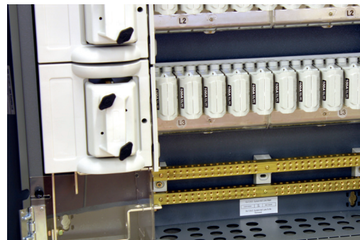
1 J MSDB 30 way MSDB showing gland plate detail