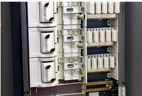
2 J MSDB Shrouds and fuse handles removed from one J way to show cable connection points