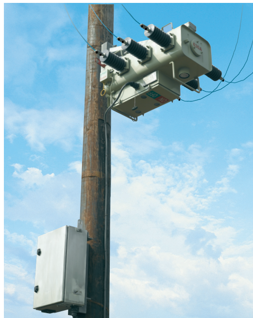
Automated Pole Mounted Load Break Switch