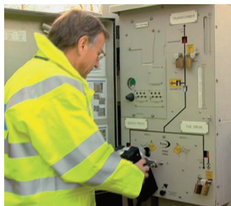
Automated Ground Mounted Ring Main Unit