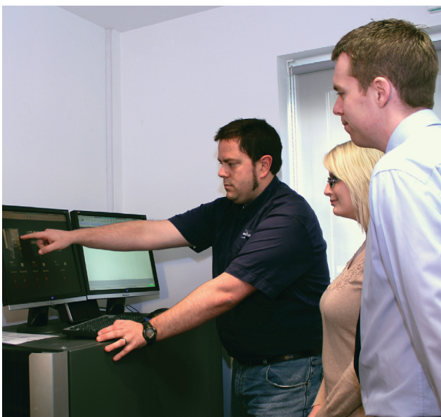
Our Oxfordshire Training Centre can offer a wide range of systems training for all of your staff.

Whether you are managing extensive networks, expanding, updating or automating your operation, Lucy Electric has the products and services to give you peace of mind, safe in the knowledge that your assets are being effectively managed.